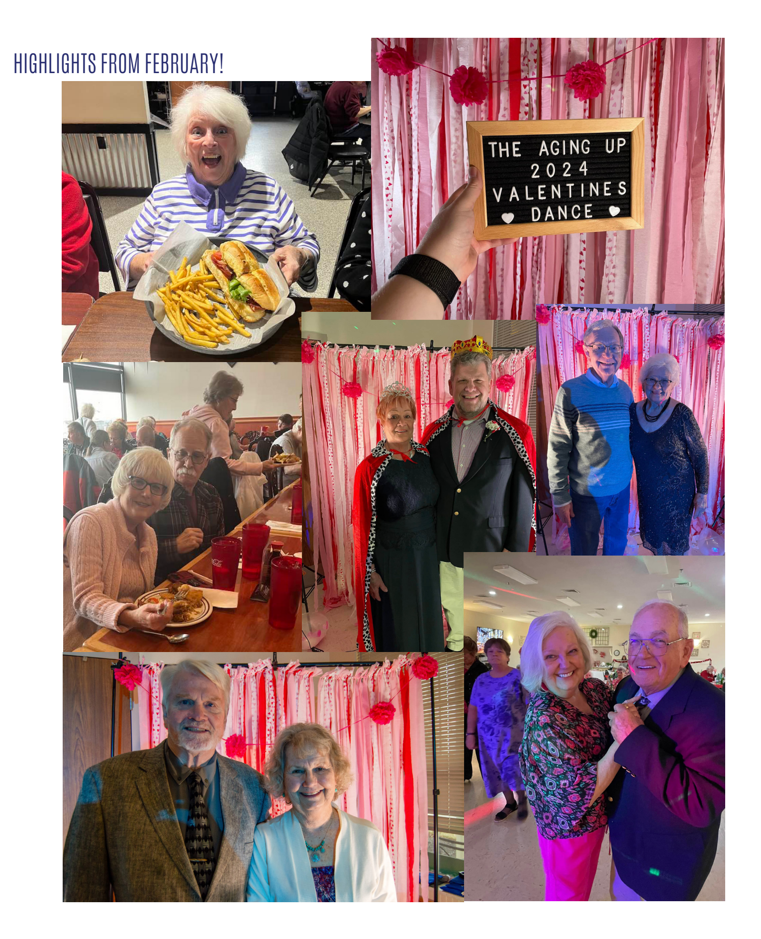
Find us on Facebook @ Clinton County Community Action Program, Inc.