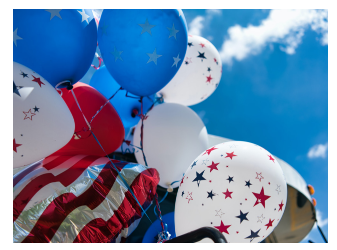
1. Where was the first celebration of Independence Day held?

2. Every Independence Day, how many times does the Liberty Bell ring?