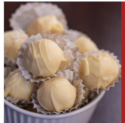
SUGAR COOKIE TRUFFLES JAMIELYN NYE