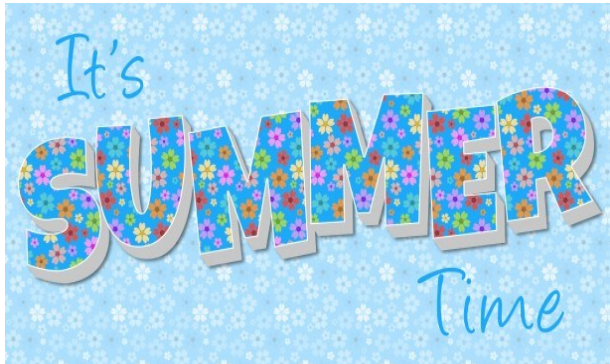
Summer begins...June 20, 2020

Activities are suspended until further notice.