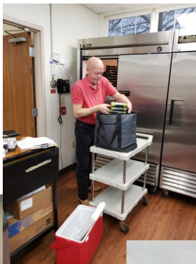
Some of the Senior Program Staff at work March 2020.

Activities are suspended until further notice.