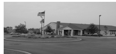
Clinton County Senior Center